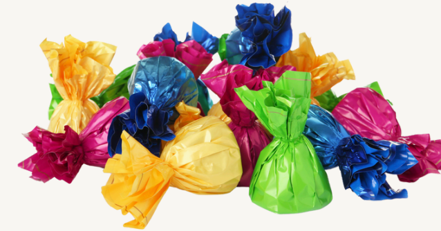
Sweet & chocolate bar wrappers