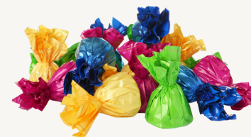
Sweet & chocolate bar wrappers